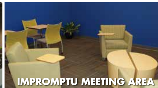
IMPROMPTU MEETING AREA