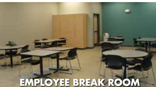
EMPLOYEE BREAK ROOM