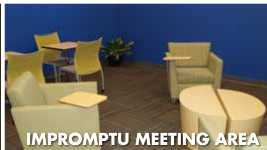
IMPROMPTU MEETING AREA