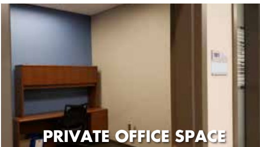
PRIVATE OFFICE SPACE